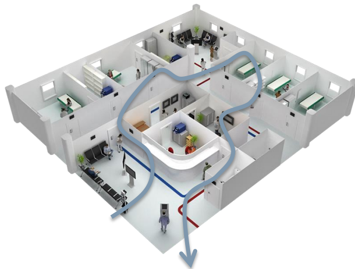
Fig 1. Understanding and managing the customer journey is key in delivering improved patient experience in healthcare.

So, how can Customer Experience Management (CEM) and Patient Flow Management (PFM) solutions and methodologies turn these challenges into opportunities – enhancing the patient experience, while improving the bottom line?